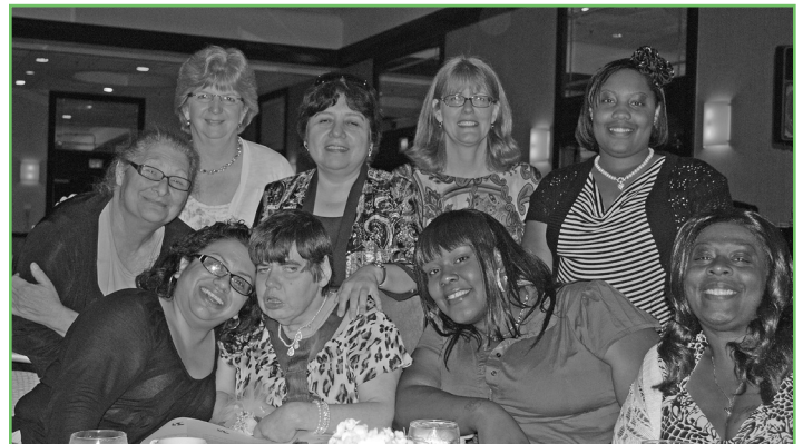
SALLY'S COMMUNITY STAR DINNER 2011